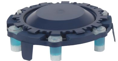
Tube Holder Pack